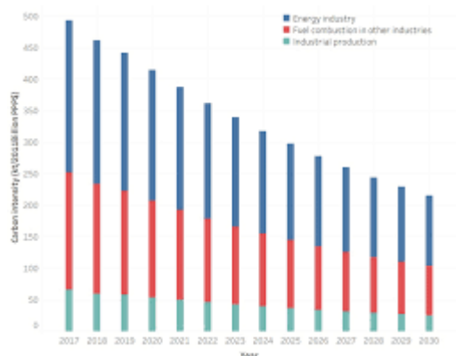
Fig. 3. CO 2 Emission Intensity Trend

Environmental Impact and Clean Environment The environmental benefits of renewable energy adoption are substantial. Transitioning from coal-based power generation to renewable energy significantly reduces carbon dioxide emissions, sulfur dioxide emissions, and particulate matter concentrations. This shift contributes to improved air quality, reduced respiratory illnesses, and lower climate-related risks.