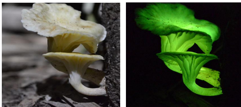
Fig. 3. Neonothopanus gardneri showing bioluminescent in the dark

Neonothopanus gardneri is a species of bioluminescent fungus belonging to the order Agaricales (Marasmiaceae) found in South America. Its existence was first reported in 1840 by George Gardner in his travels to Brazil, where it is popularly called "coco flower" (Weinstein et al., 2016). Recently, N. gardneri had some of its bioactives separated and their corresponding structures clarified. It is mostly found in decomposing leaves and in the trunk of dwarf palm trees such as "pindoba" ( Attalea oleifera ) or "babaçu" ( Orbignya phalerata ) (Fig. 3).