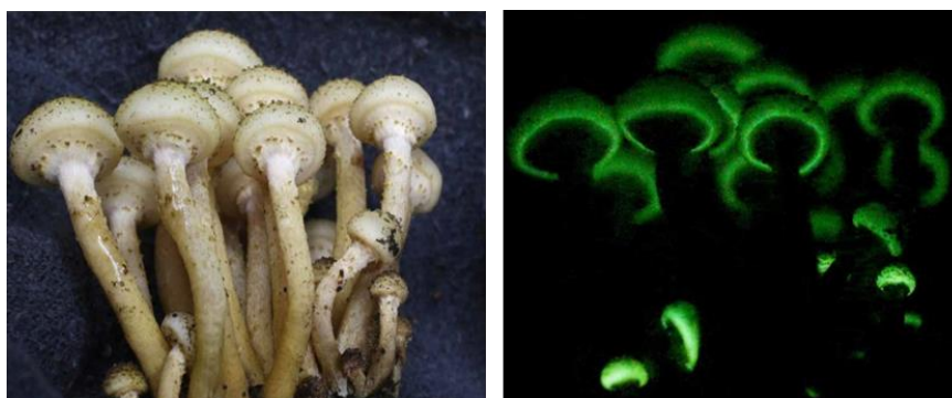
Fig. 5. Armillaria showing bioluminescent in the dark

Armillaria is one of the most important genera of fungal root pathogens worldwide. It attacks hundreds of tree species in both timber ( Abies , Picea , Pinus and Pseudotsuga ). Armillaria genus belonging to Basidiomycota, (Physalacriaceae) (Baumgartner et al., 2011). The honey fungus species Armillaria mellea , which inhabits trees and woody bushes, belongs to the genus Armillaria of fungi. It includes about 10 species formerly categorized summarily as Armillaria mellea . The largest known species is Armillaria ostoyae . Some species of Armillaria display bioluminescence, resulting in foxfire. Armillaria can be a destructive forest pathogen. It causes "white rot" root disease of forests. Armillaria can kill its host because it is a facultative saprophyte that also consumes dead plant matter, as opposed to parasites that must control their growth to prevent host death (Kirk et al., 2008). The properties and mechanisms of bioluminescence in fungi are also of interest to mycological research (Fig. 5).