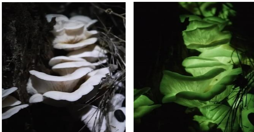
Fig. 2. Omphalotus nidiformis showing bioluminescent in the dark

Southern Hemisphere winter (June to July), it develops basidomes and continuously gives off a flimsy white-blue glow (Fig. 2).